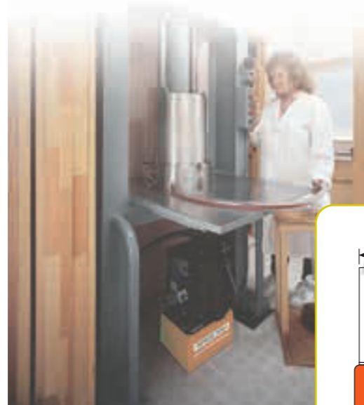
PE21 series pump and RD5513 cylinder used in a special press that produces pharmaceutical-grade extracts for herbal medicines.